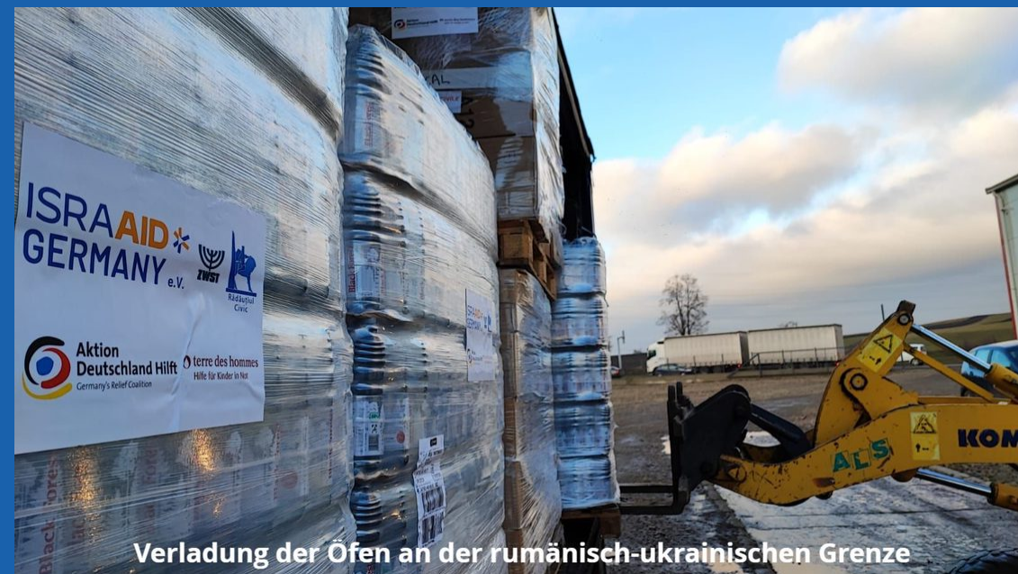
Verladung der Öfen an der rumänisch-ukrainischen Grenze

The year 2022 has of course also for us been dominated by the outbreak of war in Ukraine on 24 February.